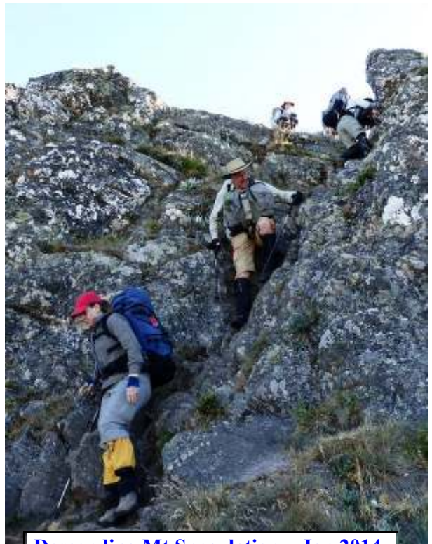
Descending Mt Speculation – Jan 2014

Away again at 0800, we stopped for the obligatory summit photos and began the descent from Mt Speculation into the Horrible Gap and then the climb to Mt Buggary – it's not really that horrible; 300m down and 250m up. Having made good time and after a well-earned break, we headed down Queens Spur. I climbed this spur in 1978 and I remember the many bluffs and false summits but had forgotten just how narrow it is in places.