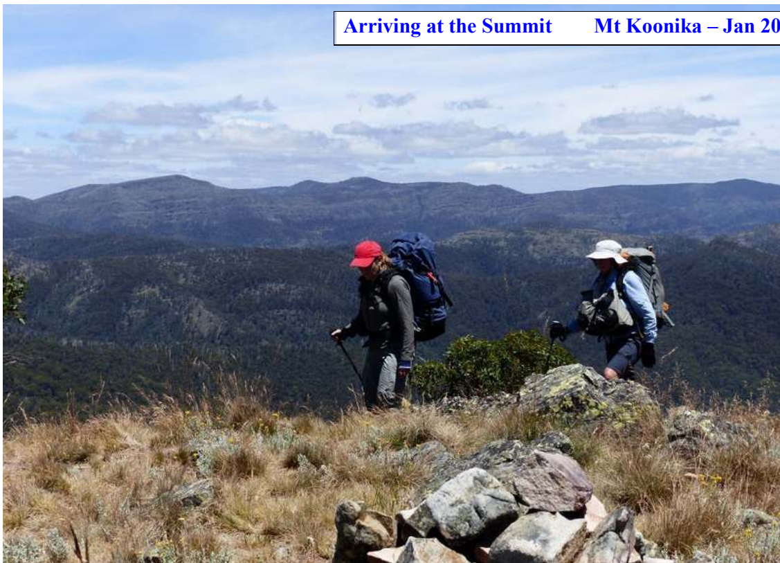
Arriving at the Summit Mt Koonika – Jan 2014

A tough day but what a variety of terrain – steep up and down, on-track, off-track, peaks and rivers, spurs and sidles, rocky bluffs and often thick vegetation – and some good navigation challenges to keep us all on our toes.