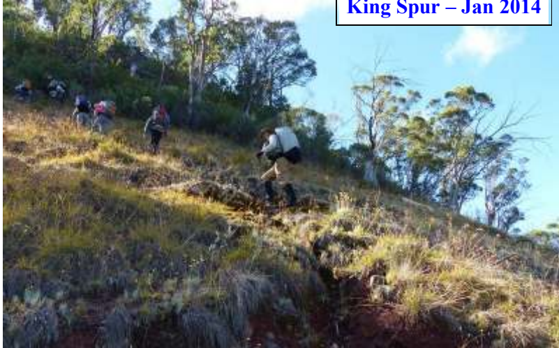
King Spur – Jan 2014

The plan was for a 3-day loop starting from King River, climbing King Spur to Mt Koonika and on to Mt Speculation. From there, we'd follow the AAWT into the Horrible Gap and up to Mt Buggary and descend Queens Spur, over the Pimple and drop off a lesser spur into the headwaters of the King River. The plan was to look for somewhere flat beside the river to camp but the contingency had us pushing on back to the cars (and a very long day).